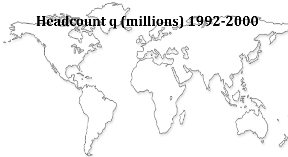
Figure 1: Regional Headcounts 1992-2000